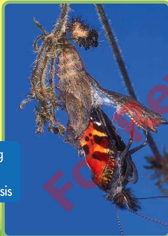
A butterfly coming out of its shell after metamorphosis