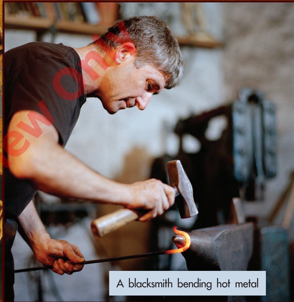
A blacksmith bending hot metal

People who bend metal for a job are called blacksmiths. Blacksmiths need to be very strong because it is hot, hard work. Blacksmiths have to be able to bend heavy metal because they need to make new shapes and objects.