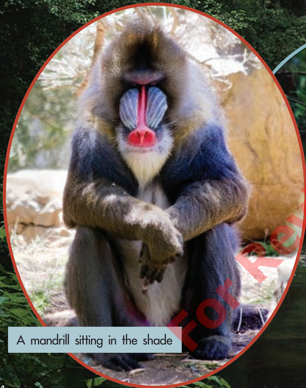
A mandrill sitting in the shade