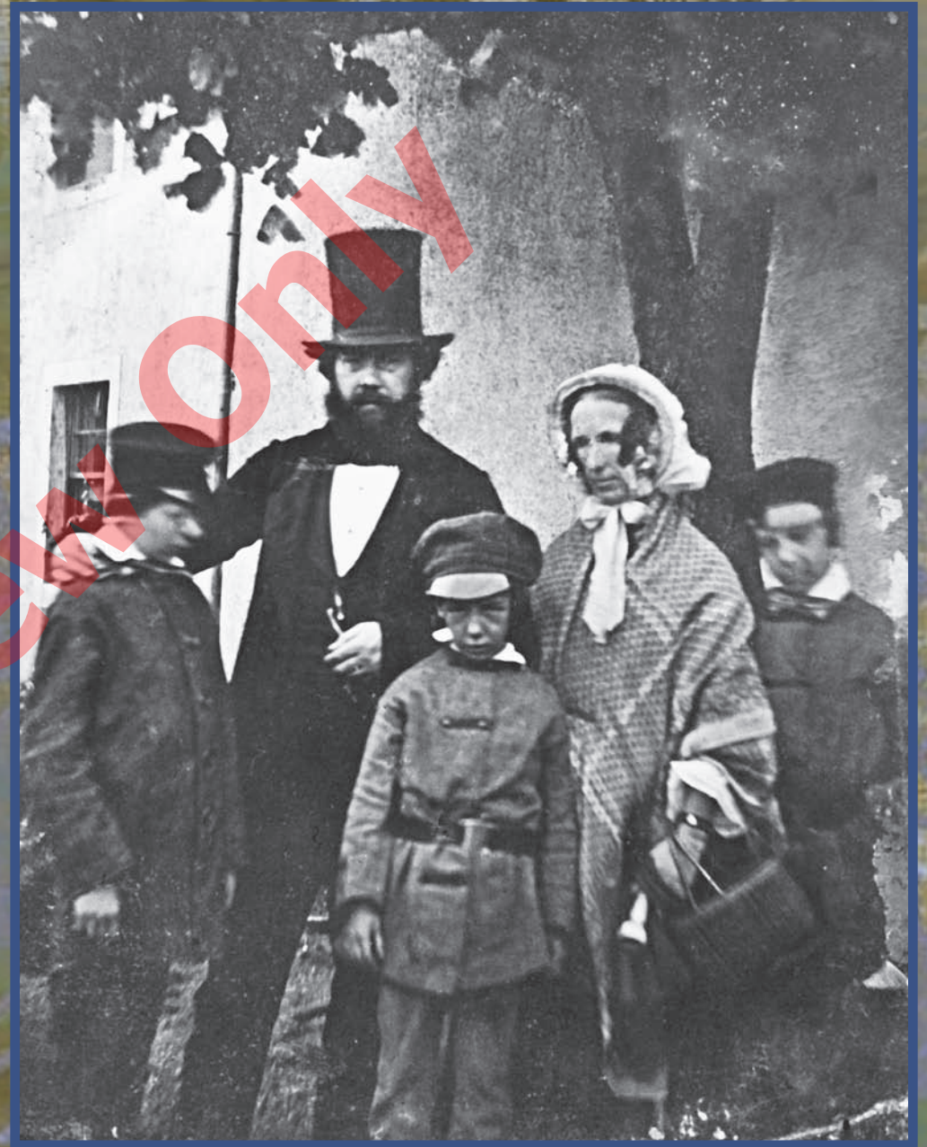
Alexander Graham Bell (right) with his parents and two brothers in Scotland

Bell was brought up in a family that helped him to study and learn. The whole family studied speech and sound. This is because Bell's father worked with deaf people. Bell's mother was deaf, too. As he grew up, Bell began to think up new devices. Then he would make them. People like this are called inventors .