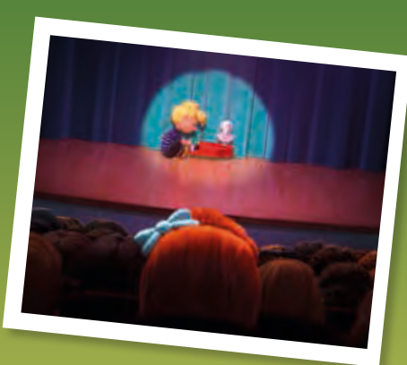
a talent show

At Charlie Brown's school this year there is