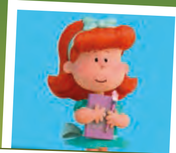
The little red-haired girl