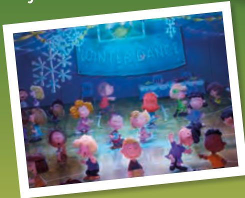
and a school dance.