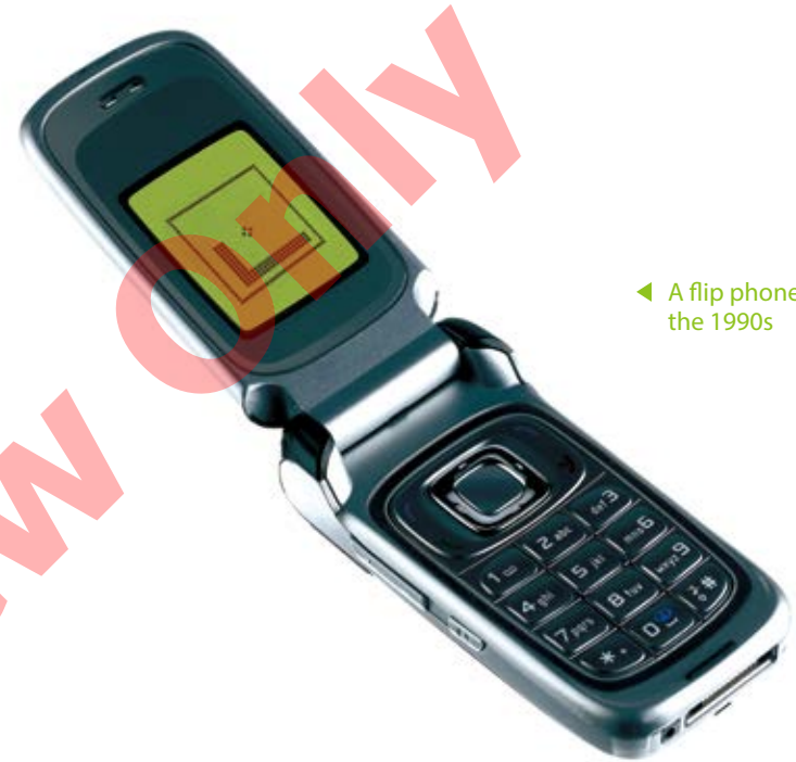
◀ A flip phone from the 1990s

Games were the first apps created for phones. The first phone game to be a big hit was Snake. It was created in the 1990s.