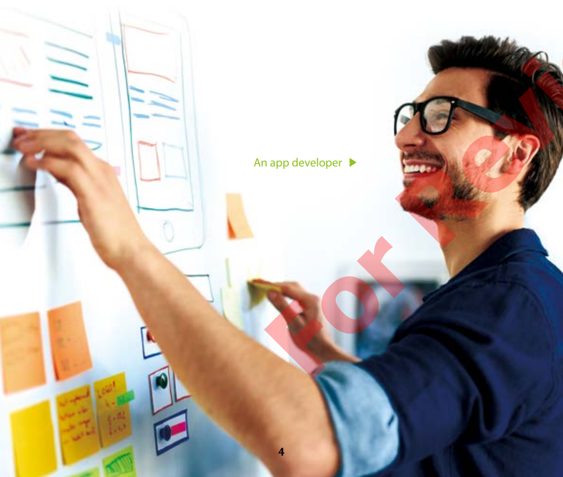
An app developer ►

Do you like playing games on your phone? Most people do! Do you ever think about who makes the games on phones? App developers do!