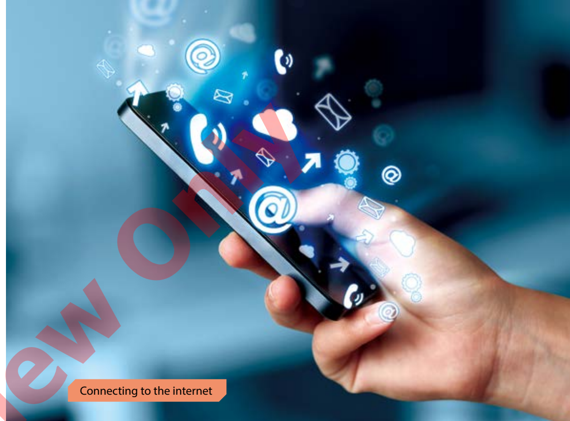
Connecting to the internet

Though we still do this, many things have changed.