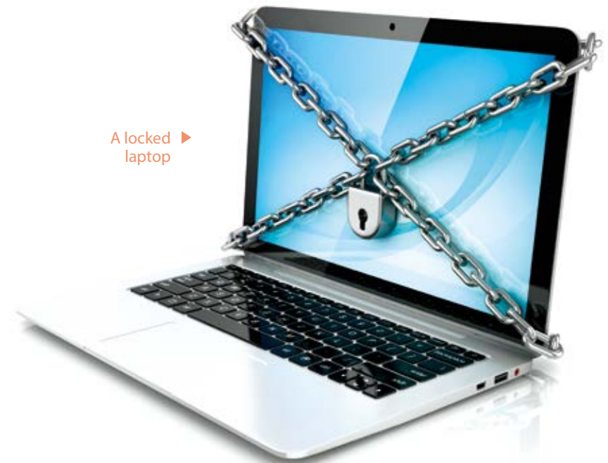
A locked laptop

All of this information could be taken by a hacker in a cyber attack.