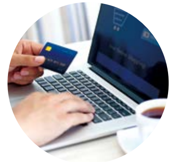
Using a bank card online ►

With the internet, we can do almost anything online.