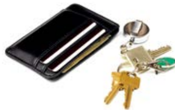
A wallet and keys ►