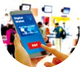
Spending money online

This means people can take our information. They can find out our phone numbers, banking numbers, or even our birthdays. They can find out our bank card numbers, passwords, and more!