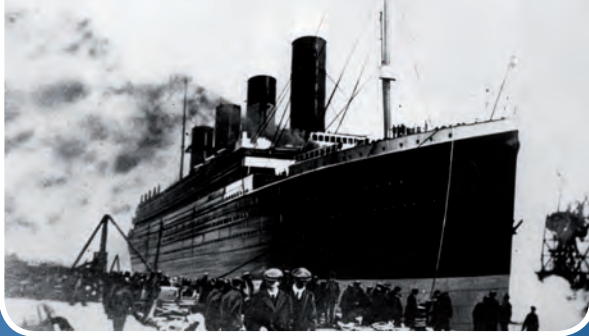
The Titanic 10 April 1912 – 14 April 1912

Look at the things from the Titanic . How old are they?