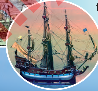
The Queen Anne's Revenge 1716 – 1718

This is Blackbeard. He is a famous pirate. His big ship, the Queen Anne's Revenge is under the sea too. Divers are looking for the things from his ship.