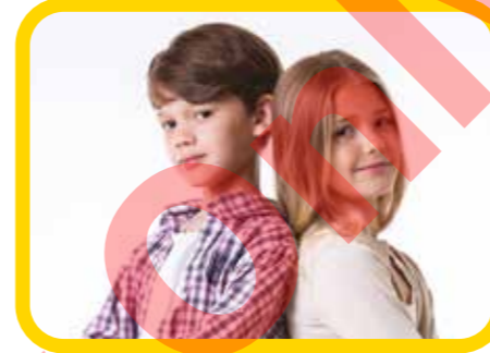
male / female (adjective)