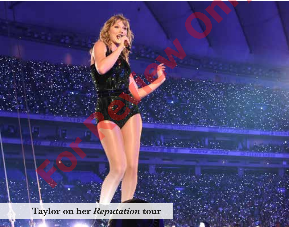
Taylor on her Reputation tour

Taylor is finishing her Reputation tour .