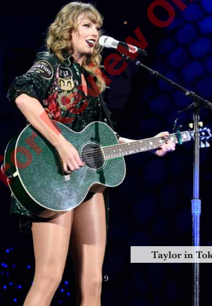
Taylor in Tokyo

Taylor Swift is a very famous singer in many countries. Let’s learn more about her . . .