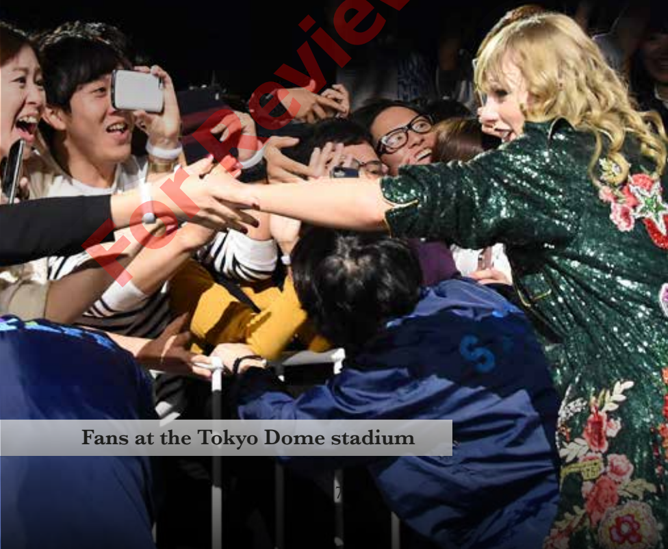
Fans at the Tokyo Dome stadium