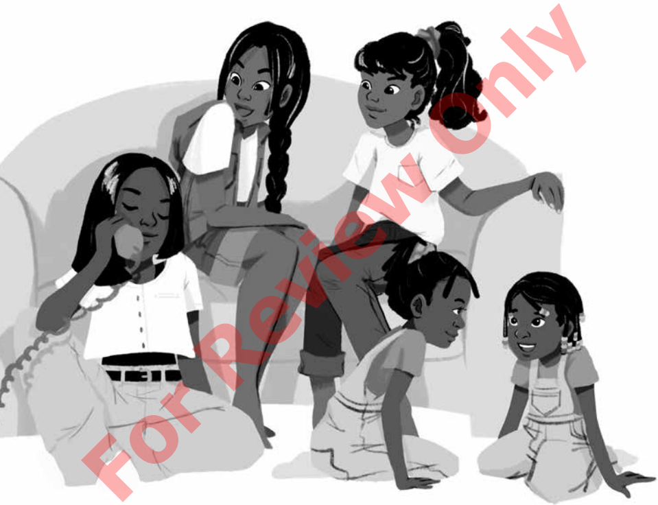
The Williams sisters

But learning tennis was not easy for Serena. Her family did not have money for tennis lessons.