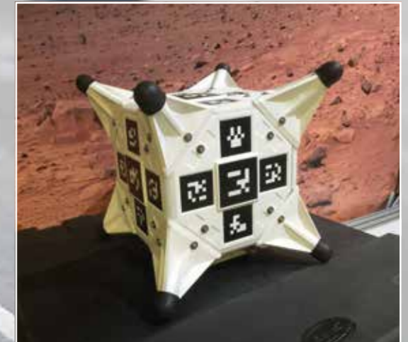
Is this a box or a robot? It is a robot!