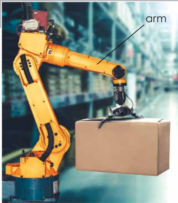
Many robots have long arms.