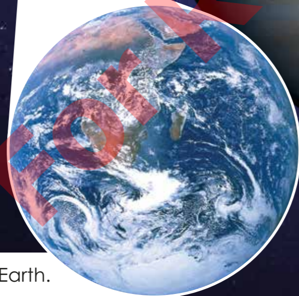
This is our planet, Earth.