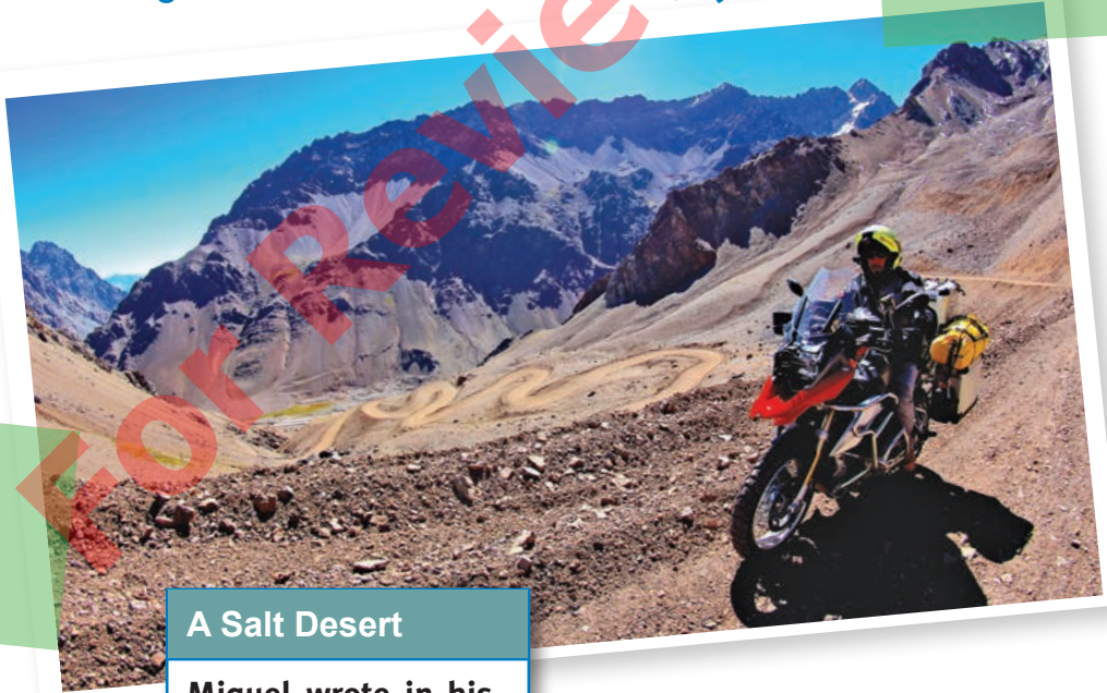
A Salt Desert