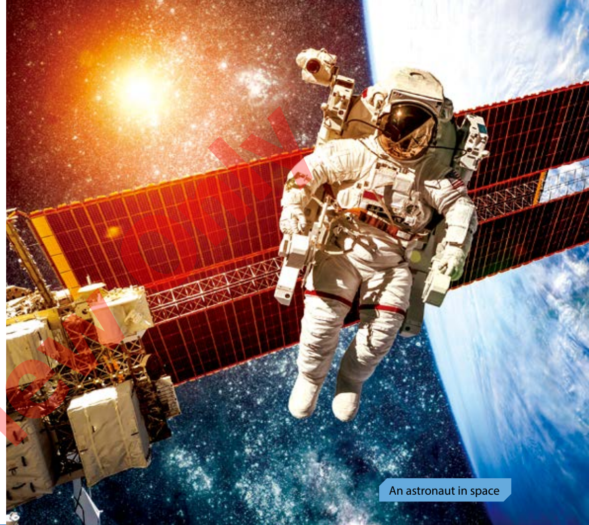
An astronaut in space

When astronauts go into space for a long time, they live in the International Space Station. The space station is also a spacecraft. However, it doesn't travel away from Earth. The International Space Station is a home in space for its crew members. It has five bedrooms, two bathrooms, and a big window.