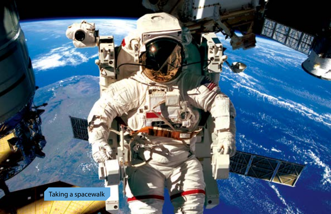
Taking a spacewalk

Astronauts usually stay in space for six months. However, 879 days is the longest time a person has stayed in space.