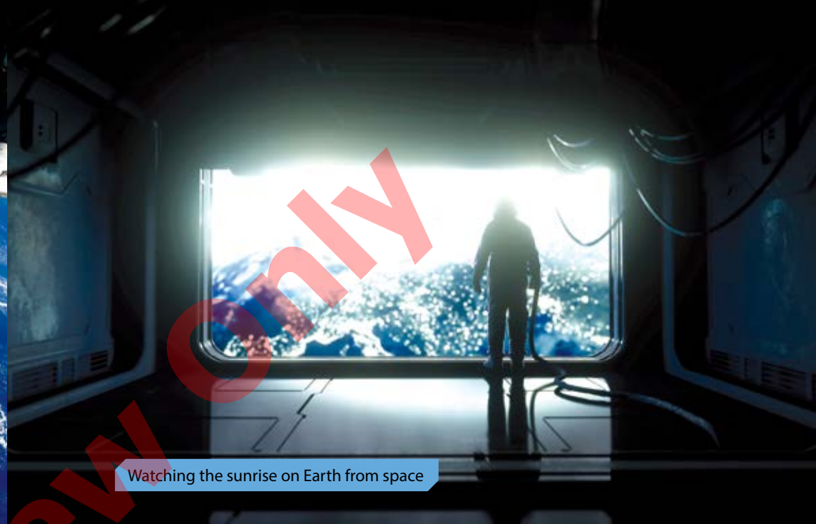
Watching the sunrise on Earth from space

Astronauts spend most of their time inside the space station. Sometimes they go outside the space station. Going outside is called “taking a spacewalk.” When the astronauts go on spacewalks, they have to wear a spacesuit to protect their bodies. They go on spacewalks to fix things on satellites or test new machines outside the spacecraft. They can also do science experiments on spacewalks.